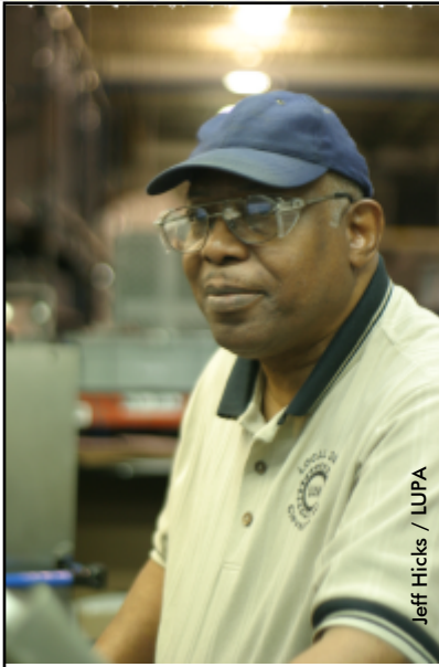
Jeff Hicks / LUPA